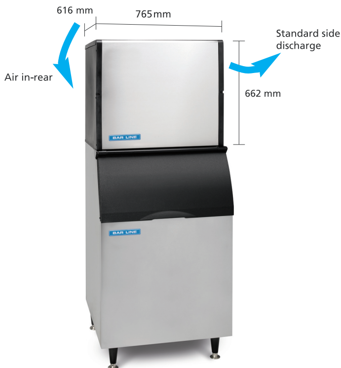
BM 1005 AS on BIN 550