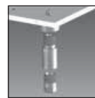
Available as optional KITLGSEXT000