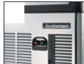
Front ON-OFF Switch Storage bin antibacterial pouch & holder