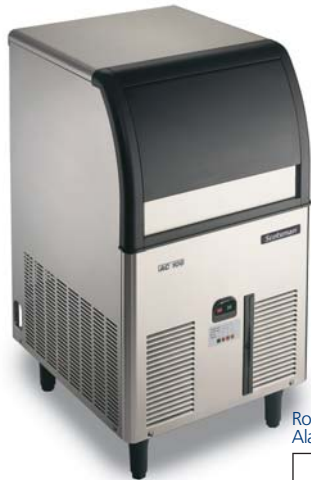
Routine Maintenance Alarm