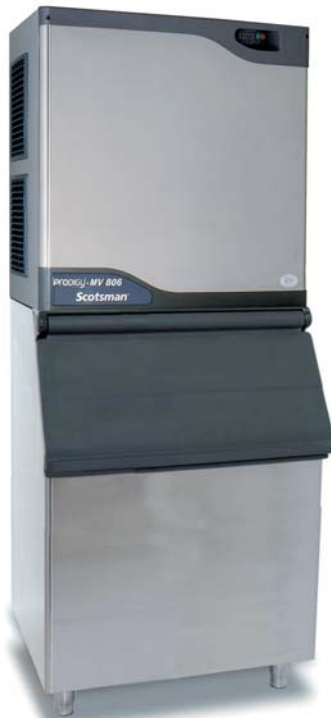
P-MV 806 with SB530 (sold separately)