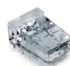
Small Cube - 6 g W 11 x D 23 x H 26 mm