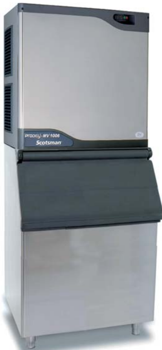
P-MV 1006 with SB530 (sold separately)