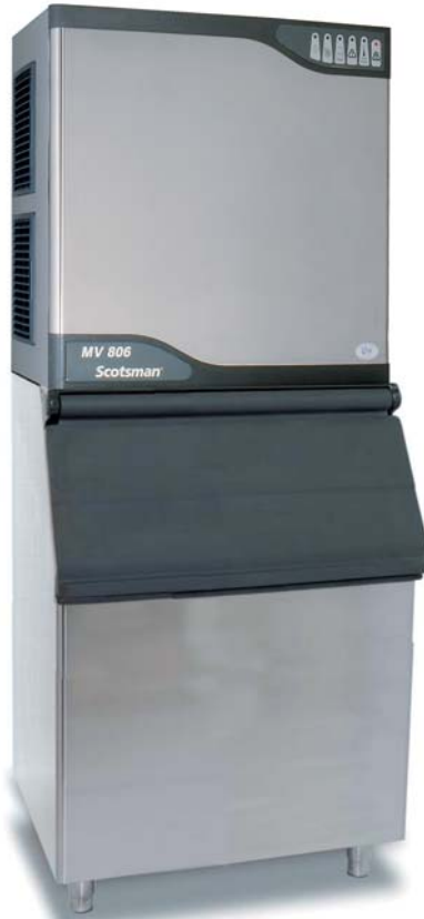
MV 806 with SB530 (sold separately)