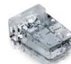
Small Cube - 6 g W 11 x D 23 x H 26 mm