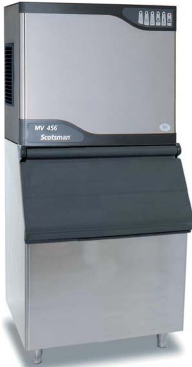
MV 456 with SB393 (sold separately)