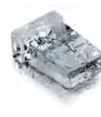
Small Cube - 6 g W 11 x D 23 x H 26 mm