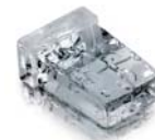
Half Dice Cube - 6 g 11 x 23 x 26 mm