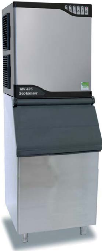
MV 426 with SB322 (sold separately)