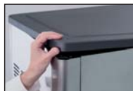
ABS plastic top cover