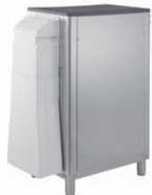
Standard ice shut included