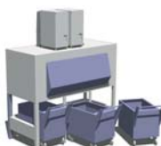
MF 88Split+ITS3250 (sold separately)