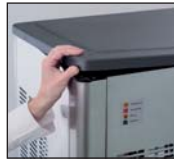
ABS plastic top cover