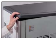
ABS plastic cover