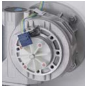
Gear box protection (hall effect)