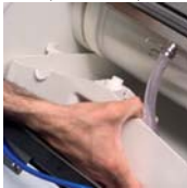
Easy to remove water sump