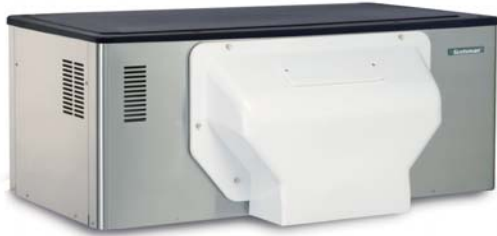
ABS Ice Chute Cover: sold separately.