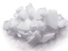
Residual water content 2%

Subject to certain limitations and exclusions