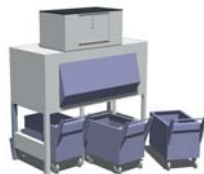
MAR 308+ITS3250 (sold separately)