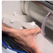
Easy to remove water sump