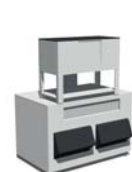
MAR 306+UBH2250 (sold separately)