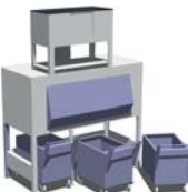
MAR 306+ITS3250 (sold separately)