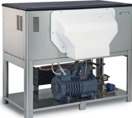
ABS Ice Chute Cover: sold separately.