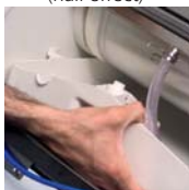
Easy to remove water sump