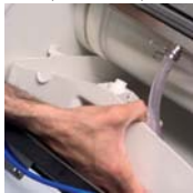
Easy to remove water sump