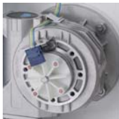
Gear box protection (hall effect)