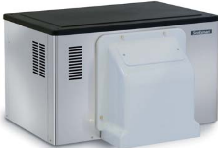
ABS Ice Chute Cover: sold separately.