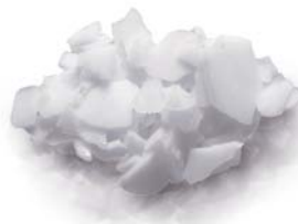
Residual water content 2%

Subject to certain limitations and exclusions