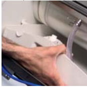
Easy to remove water sump