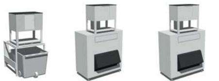
MAR 106+RBCSTAND (sold separately)