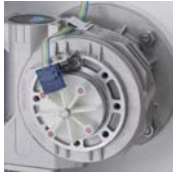
Gear box protection (hall effect)