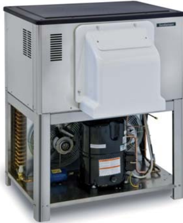
ABS Ice Chute Cover: sold separately.