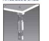
Available as optional KITLEGSSOCKED