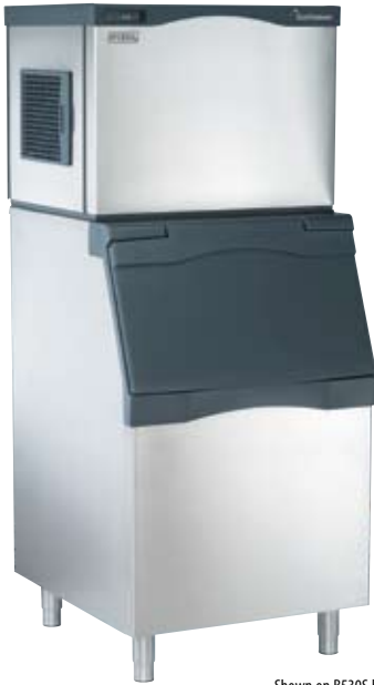
Shown on B530S bin.