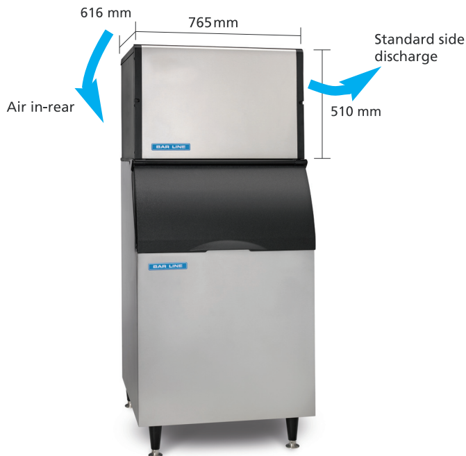
BM 305 AS on BIN 550