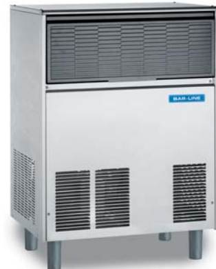
B 90 AS/WS

Bar Line is one of the best known and longest standing successful ice machines brands in Europe. Originally dedicated mainly to self-contained units, producing the thimble-shaped rounded ice cubes, the Bar Line equipment range has recently been extended to modular units in various capacities and ice types. Bar Line units are built with sturdy, corrosion resistant stainless steel, and feature European made components to assure maximum quality and reliability. Tested one by one in the Italian manufacturing plant of Frimont Spa, ISO 9001 Certified, the Bar-Line self contained units feature well balanced ratio between production and storage capacity, alongside with reduced outer dimensions that allow for built-in installations. Front air louvers assure appropriate airflow in critical install requirements; various daily productions are available for best suitable model selection.