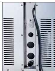
Recessed Connections Panel