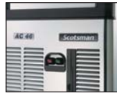
Front ON-OFF Switch