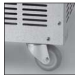
Pivoting rear wheels