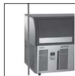
h. 798 mm with short legs