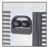
Front ON-OFF switch